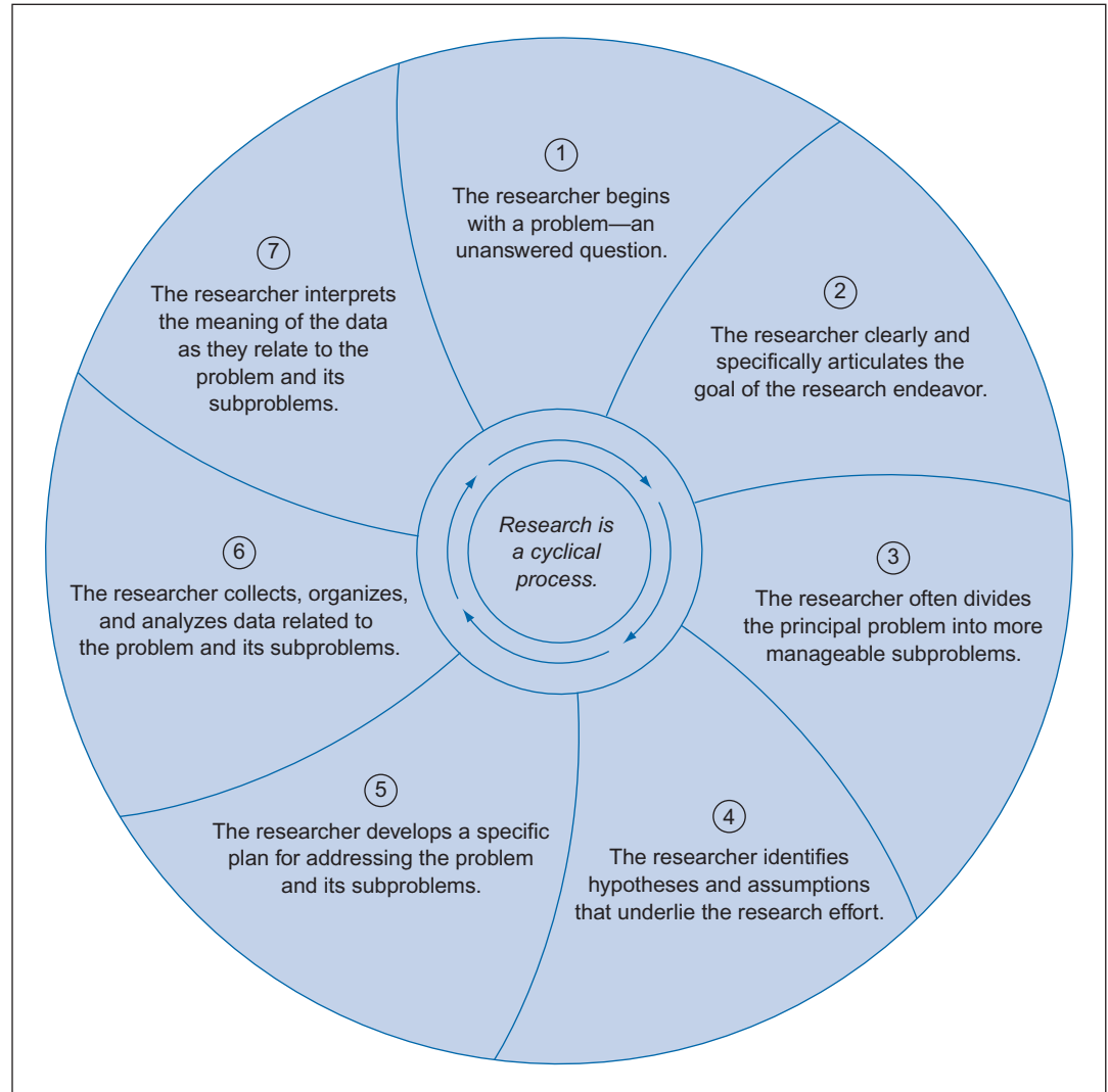
FIGURE 1.1 ■ The Research Cycle

An inquisitive mind is the beginning impetus for research; as one popular tabloid puts it, “Inquiring minds want to know!”